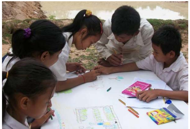
Children Drawing Contest under the Theme, “Understanding Child Labor in Agriculture”