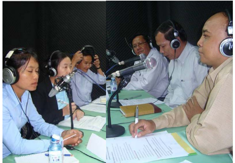
Guest Speakers in the Studio are Replying Questions to Callers