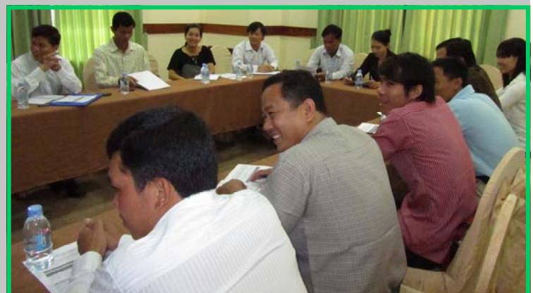
Putting Ideas to Work

The annual staff strategic planning workshop of the CHES project gave the opportunity for staff to present their progress about work completed or ongoing within their unit, and to prepare the annual work plan for the following year. This workshop gathered staff to build close relationship for team work.