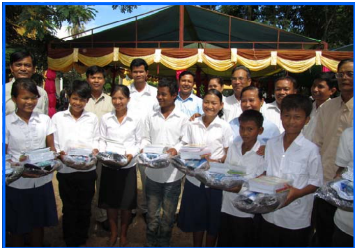
Scholarship Distribution in Prey Veng Province

The CHES project distributed scholarship kits to 4,466 students (2,726 females) during November and December 2010 in four target provinces. This is the last scholarship support to eligible students enrolled in 2007. It was the last The event was presided by local authorities, KAPE, Wathnakpheap and Winrock International.